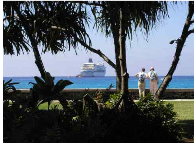
Carol and Laveta with the Norwegian Wind at Kailua-Kona

distinguish Mauna Kea and Mauna Loa making their appearance above the horizon. Breakfast, then morning in Kailua. The Palace Museum is particularly interesting, then back to the boat for lunch and a rest in our staterooms. Tonight, Jim and I stand outside above the bow on deck number ten. The wind howls and a light salt spray covers everything. The sky is dark and clear, Orion high overhead. Below, just clearing the horizon shines the Southern Cross.