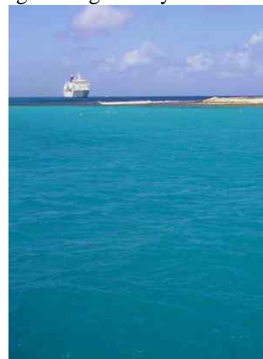
Looking out through English Harbor

February 25 (Tuesday) Fanning Island: I'm up early, peeking out our cabin window as our destination materializes out of the dawn. Putting on some clothes I venture out onto the forward deck to take it all in. A few Frigate birds with their large distinctive wings and forked tails, circle not far away. Out past our bow, Fanning (also known as Tabuaeran) looms low and wide, covered in palm trees. I can see "English Harbor" about 600 yards ahead. The harbor is maybe 250 yards wide and leads into a light, blue-green lagoon beyond.