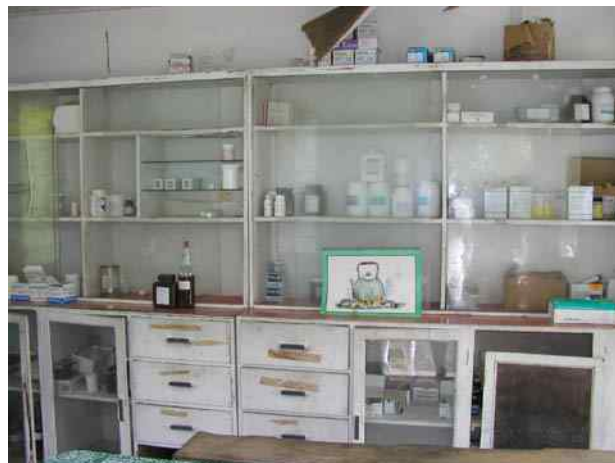
Fanning "hospital dispensary"

There are children in abundance- most well groomed, shy and very polite- like all the islanders. There are no roads per se, but unpaved, narrow and wide paths connect their lives. No electricity, no running water, no sewers. Privies are just rock lined holes with low walls. We are shown water wells, though the water must be boiled before drinking. No electricity means no Internet, but much more serious, it means no refrigerators. Whatever is killed, caught or gathered, must be eaten within a day or two.