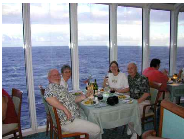
Dinning in the amidships dining room

On Fanning, there are no world class musical performances, certainly no symphony. No philosophical discourse, or reports of the latest scientific discoveries. Far better, I believe, to be part of a civilization that’s “going somewhere” (hopefully) and to partake in the stimulating environment of a modern society with its rich assemblage of knowledge and experiences. Once intoxicated by the richness of modern life, it would be exceedingly difficult to return to a life on Fanning, even with its forlorn, idyllic beauty and the environmental clemency of its unchanging tropical climate. That said, Fanning residents seemed quite happy, even in the absence of health care- as evidenced by children with facial skin lesions, and signs of (healed) but poorly set fractures. But hey- life is short, and you can die in loneliness and despair... even in Seattle.