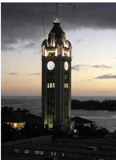
Aloha Tower at Sunset

February 21 (Friday): An easy morning. We have breakfast near the hotel, then Laveta and Carol do a load of laundry, followed by a walk on the beach, a light lunch and a nap. Laveta and I stop by the US Army museum, later meeting Jim and Carol in the hotel to finish packing. At four thirty in the afternoon, a bus takes us to the “Norwegian Wind” which turns out to be berthed in downtown Honolulu adjacent to the Aloha Tower. Our ship departs around 8:30 PM as the sky darkens and city lights adorn the skyline. A couple of hours later, leaning on the forward deck railing, we marvel at the stars and Milky Way filling the sky. Our ship’s course holds Orion just off our starboard quarter as we journey Southeast.